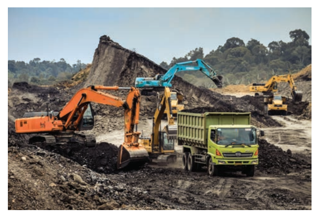
To help prevent global warming it is estimated that over 80% of current coal reserves will need to remain unused through 2050

Stephen Russell, from the World Resources Institute, explains why fossil fuel companies should disclose the potential greenhouse gas emissions from their reserves as investors look to determine potential downside risks.